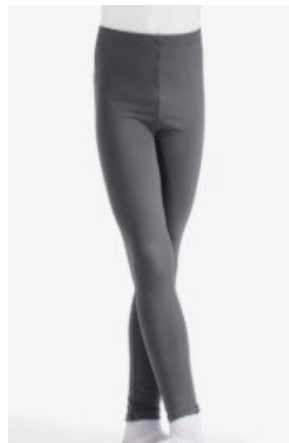
Laiken: white ballet shirt & gray ballet pants