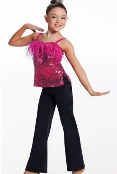
includes rhinestone hairclip