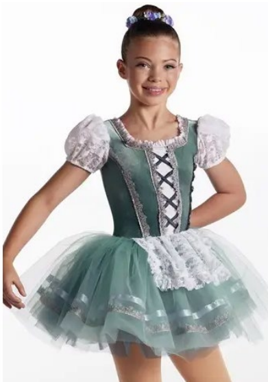
Includes floral bun crown