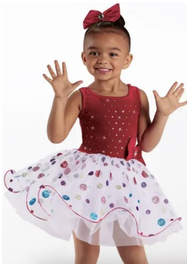
includes hairbow & light suntan tights